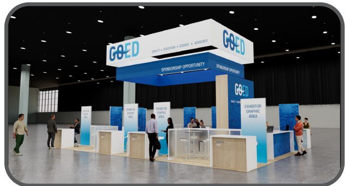
GOED Omega-3 Resource Center Booth Rendering